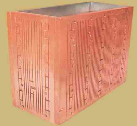
Continuous Casting Mould Plates