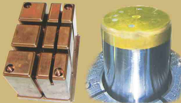
Plastic Mould Materials