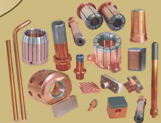
Electrical Switchgear Contacts