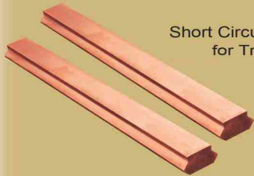
Rotor Wedge Profile For Turbo Generators