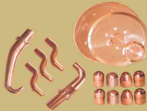
Resistance Welding Products